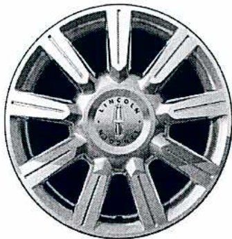
★ 17"x7.5" 9-Spoke Machined Aluminum with Painted Pockets Standard