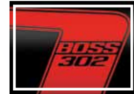
Black (UA) w/ Race Red Livery

Boss 302 Laguna Seca offers a unique livery with the grille surround, mirror caps and roof painted Race Red.