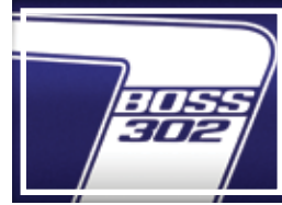
Kona Blue Metallic (L6) w/ Offset White Livery