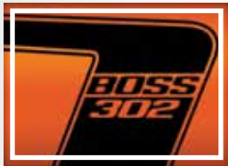
Competition Orange (CY) w/ Gloss Black Livery

Mustang Boss 302 offers a unique appearance with select exterior colors and a Black or White painted roof panel color-coordinated to the side C-stripe.