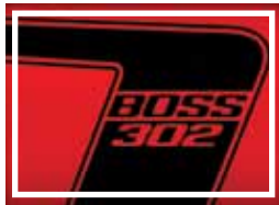
Race Red (PQ) w/ Gloss Black Livery