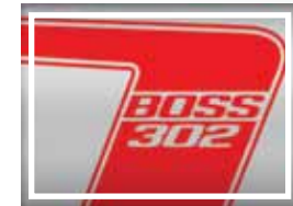
Ingot Silver Metallic (UX) w/ Race Red Livery