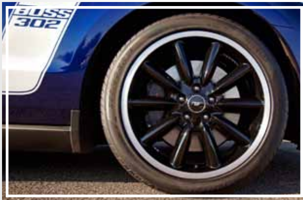
19" Black painted aluminum wheel - 9" front/9.5" rear