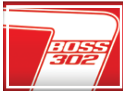
Race Red (PQ) w/ Offset White Livery