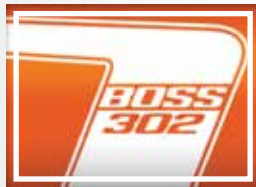
Competition Orange (CY) w/ Offset White Livery