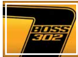
Yellow Blaze (NQ) w/ Gloss Black Livery