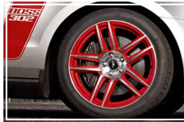
19" lightweight Red painted/machined aluminum racing wheel - 9" front/10" rear