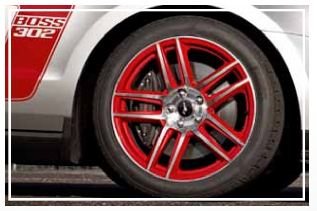
19" lightweight Red painted/machined aluminum racing wheel - 9" front/10" rear