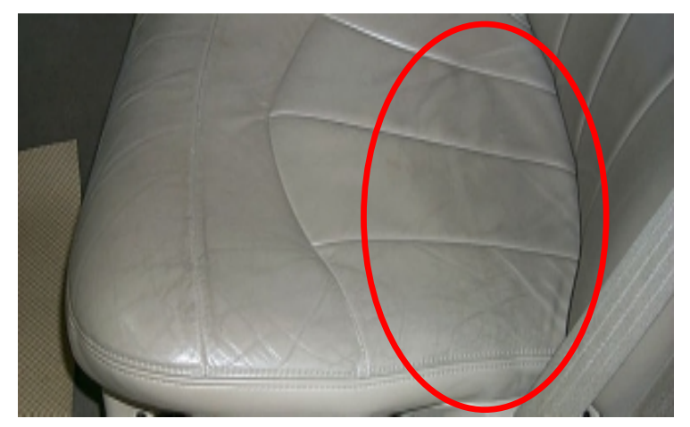
Soiled and dirty