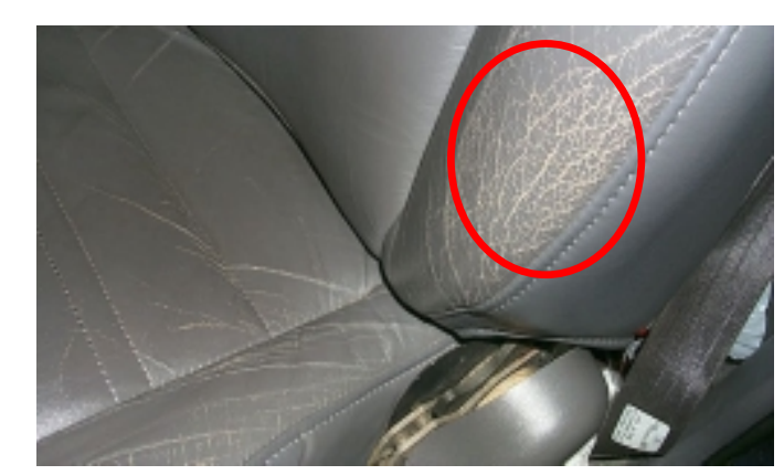
Top coat removed, subsurface leather visible