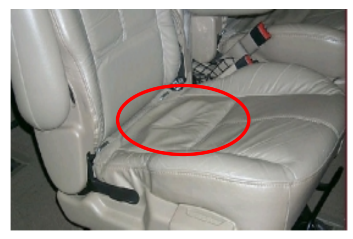
Baggy - excessive wrinkling

For questions regarding warranty coverage, please consult the Warranty & Policy Manual.