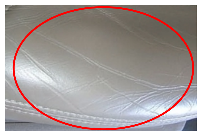
Normal leather wear and deterioration which exhibits wear lines or "cracking" that does not have top coat removal.

For questions regarding warranty coverage, please consult the Warranty & Policy Manual.