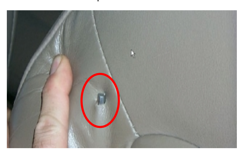
Frame wear through