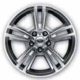
17-in. Painted-Aluminum Wheels Standard