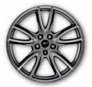
19-in. Dark Stainless Painted-Aluminum Wheels included with Brembo Brake Package