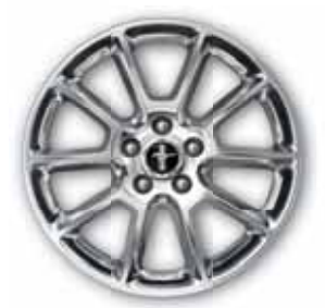
18-in. Polished-Aluminum Wheels included with V6 Pony Package