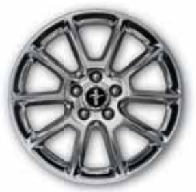
18-in. Sterling Gray Metallic Painted-Aluminum Wheels included with Mustang Club of America Edition