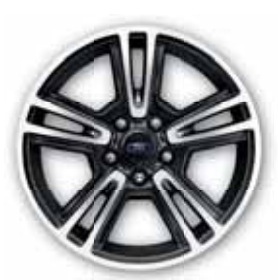
17-in. Machined-Aluminum Wheels with Painted Pockets Standard