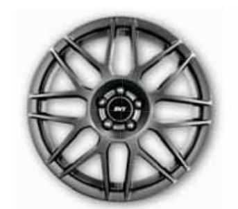
19-in. x 9.5-in. Painted, Forged-Aluminum Wheels with P265/40R19 Front and 20-in. x 9.5-in. Painted, Forged-Aluminum Wheels with P285/35R20 Rear Tires available with SVT Performance Package