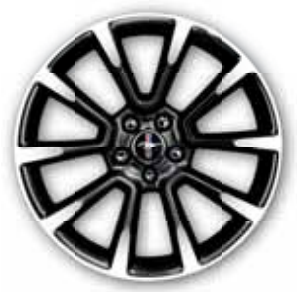
19-in. Painted Machined-Aluminum Wheels included with V6 Performance Package