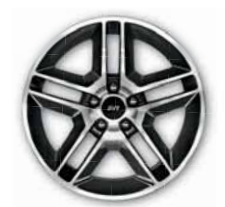
19-in. x 9.5-in. Premium Painted-Aluminum Wheels with P255/40R19 Front and P285/35R19 Rear Tires Standard

SVT Performance Stripes: ♦ White with Black Accent ♦ Red with Black Accent ♦ Red with Silver Accent