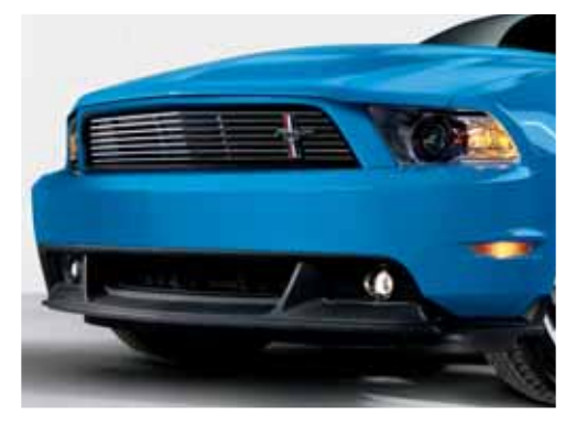
Chrome Billet-Style Grille and Front Lower Fascia