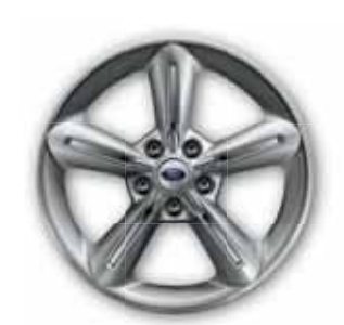
18-in. Wide-Spoke Painted-Aluminum Wheels Standard