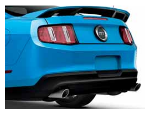
Rear Lower Fascia - Diffuser-Style