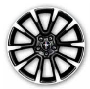
19-in. Painted Machined-Aluminum Wheels included with V6 Performance Package