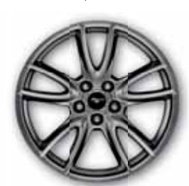
19-in. Dark Stainless Painted-Aluminum Wheels included with Brembo Brake Package