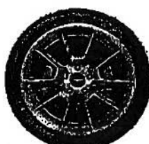
18" Polished Aluminum Wheel w/ Tri-bar Center Cap Standard with Pony Package (202A) Opt. on GT Prem. {400A/401A} (64M) *