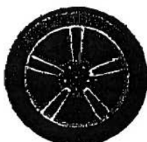
17" Machined Aluminum Wheel with Painted Pockets Std. on V6 Premium {200A/201A} (64T) *