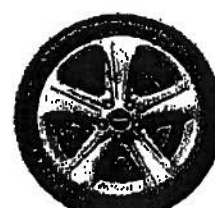
18" Painted Aluminum Wheel Opt. on V6 Premium {200A/201A} (649) *