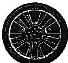
19" Bright Machined Aluminum Wheel w/ Tri-bar Pony Center Cap Opt. on GT Premium {400A/401A}, (64X) *