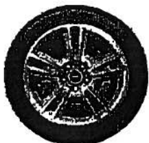
17" Painted Aluminum Wheel Std. on V6 {100A/101A} (64U) *