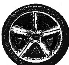
18" Premium Painted Luster Nickel Aluminum Wheel w/ Tri-bar Pony Center Cap Opt. on GT Premium {400A/401A} (64V) *