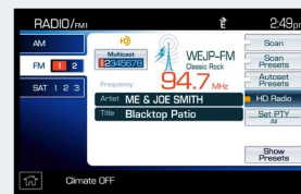
Navigation Radio (Tab-based interface)