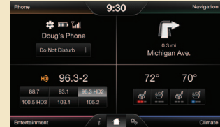
MyFord Touch®/ MyLincoln Touch™ (8-in. touch screen)