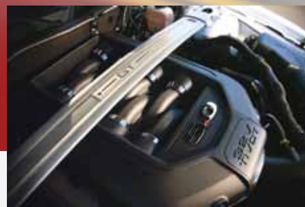
AVAILABLE STRUT TOWER BRACE SHOWN