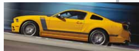
2013 MUSTANG BOSS 302

For a complete list of what's new for 2013, go to esourcebook.dealerconnection.com .