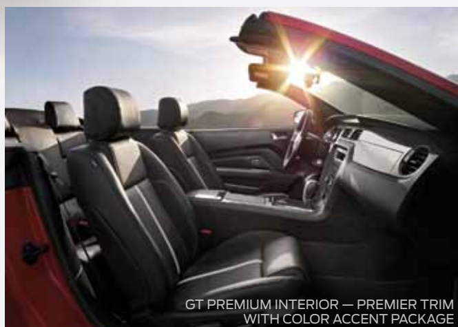
GT PREMIUM INTERIOR — PREMIER TRIM WITH COLOR ACCENT PACKAGE

For a complete list of what's new for 2013, go to esourcebook.dealerconnection.com .