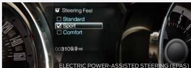
ELECTRIC POWER-ASSISTED STEERING (EPAS)