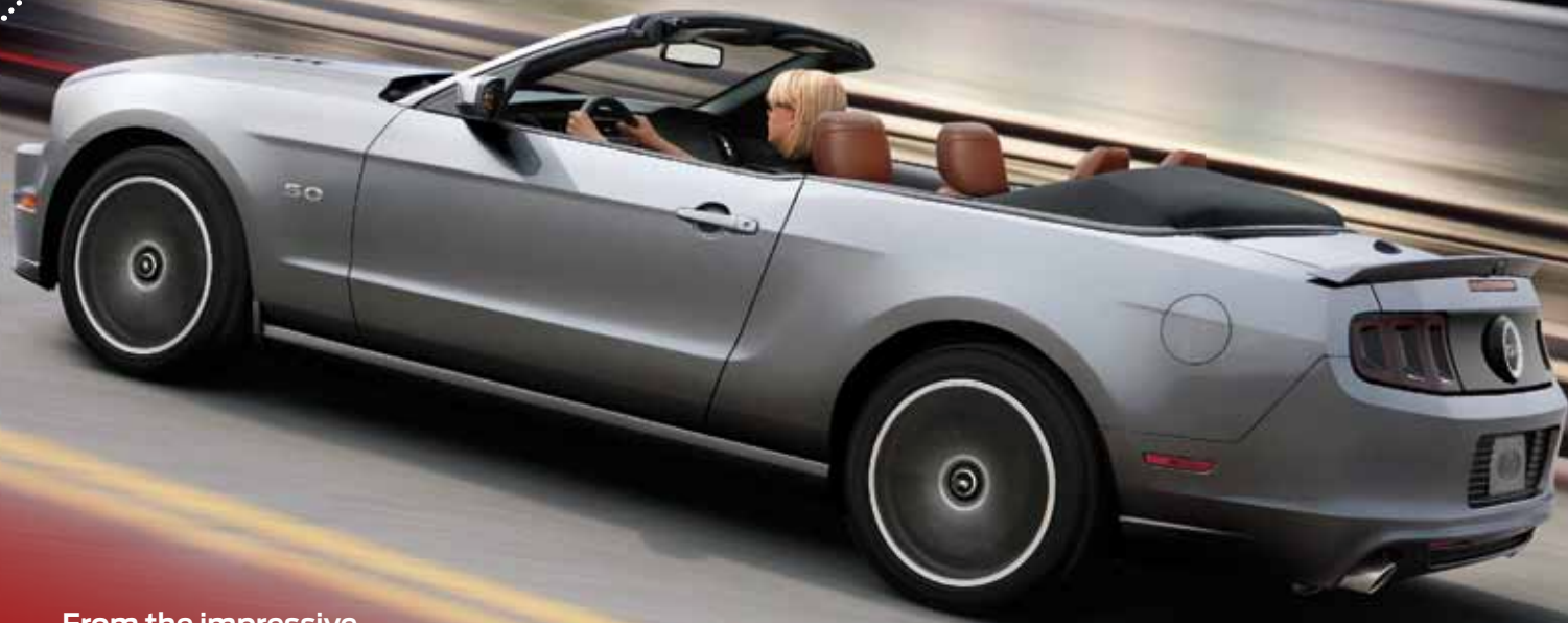
2013 MUSTANG GT CONVERTIBLE

From the impressive power and efficiency of our V6 models to the legendary strength of our V8s, each one of our ponies has been bred to lead. For 2013, there are all sorts of dramatic new features — each of them designed to excite and delight the Mustang enthusiast in all of us!