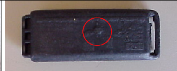
Air Intake Port plugged with tire material.