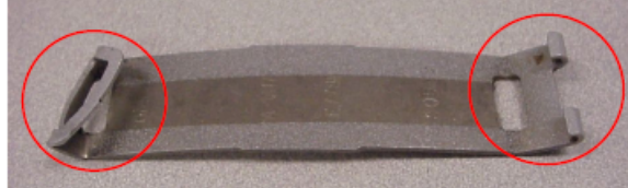
Cradle damaged from driving on flat tire.