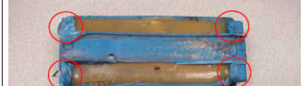
Driven on a flat tire. All four sensor feet are crushed.