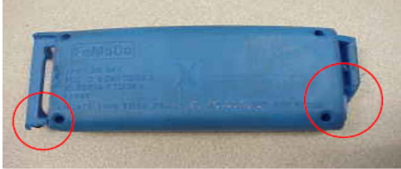
Broken CPA Retaining feature and Hinge tabs.