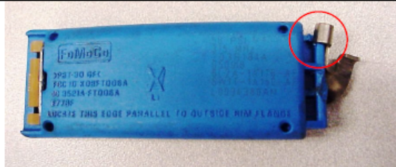
Hinge Tab torn by improper tire removal.