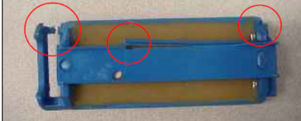
Sensor broken by Tire Changer Bead Breaker Paddle.