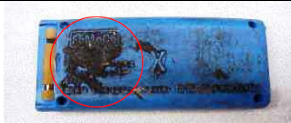
Sensor damage due to driving on flat tire for extended period. Tire material embedded in sensor.