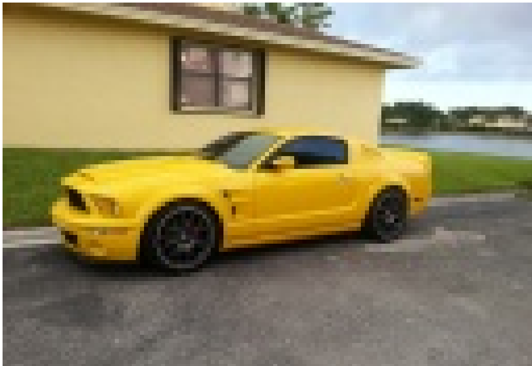
Shelby GT350 Member