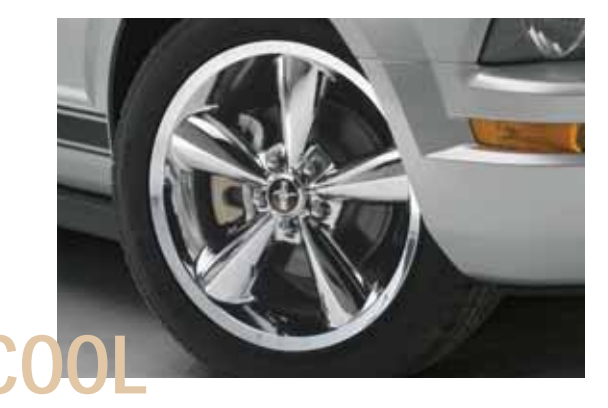
Custom Wheels. These Mustang 18" wheels rock... and keep you rolling in style. You'll find a great selection of custom-designed wheels on pages 12-13.

Splash Guards. Keep mud, snow and ice from lower body panels with durable splash guards. Two different styles are featured on page 8.