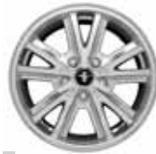
16" Bright Machined-Aluminum with Chrome Spinners Standard on V6 Premium