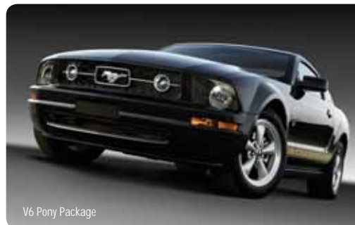
V6 Pony Package