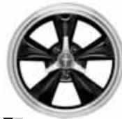
17" Painted Black Aluminum