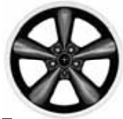
18" Euroflange Cast-Aluminum with Dark Argent Finish Standard with BULLITT™ Package