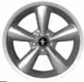
18" Polished-Aluminum Available on GT Premium; Standard with GT California Special Package