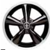
18" Painted Black Aluminum