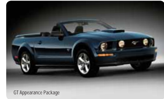
GT Appearance Package