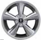
18" Chrome-Aluminum Available on GT Premium