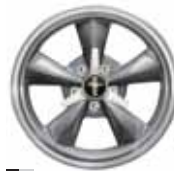
17" Painted Argent Aluminum