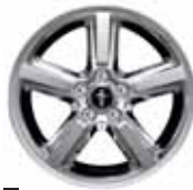
18" Polished Forged-Aluminum