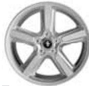
18" Premium Polished Forged-Aluminum Available on V6 Premium (Coupe only)