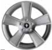
18" Premium Aluminum Available on GT