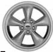
17" Painted-Aluminum Standard on GT and GT Premium