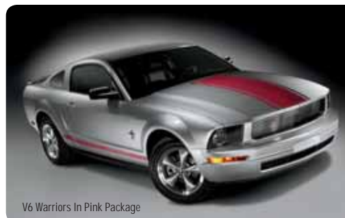
V6 Warriors In Pink Package