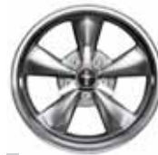
17" Painted Silver Aluminum