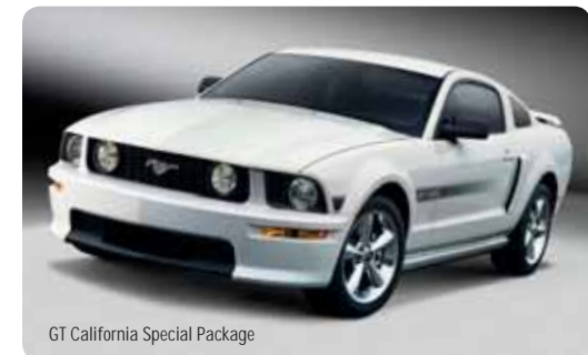
GT California Special Package