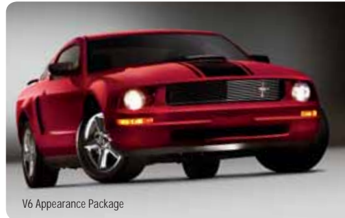
V6 Appearance Package

Premier Trim With Color Accent Package Includes wrapped and stitched instrument panel brow, console lid and upgraded door armrests; satin aluminum-plated shift lever (automatic) or bright polished shift knob (manual); aluminum pedal covers; leather-trimmed sport bucket front and rear seats; matching door-trim inserts and floor mats; and your choice of 4 interior color combinations