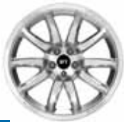
18" Polished Forged-Aluminum Standard on GT500KR