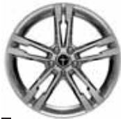
18" 5-Spoke Chrome Available 4 th quarter 2008