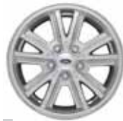
16" Bright Machined-Aluminum Standard on V6