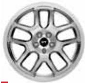
18" Bright-Machined Aluminum Standard on GT500