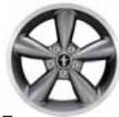
18" Painted Argent Aluminum