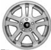
17" Bright Machined-Aluminum Split-Spoke Available on V6 Premium, GT and GT Premium