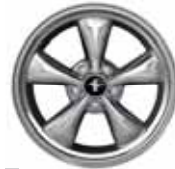
17" Painted-Aluminum Standard with V6 Pony Package