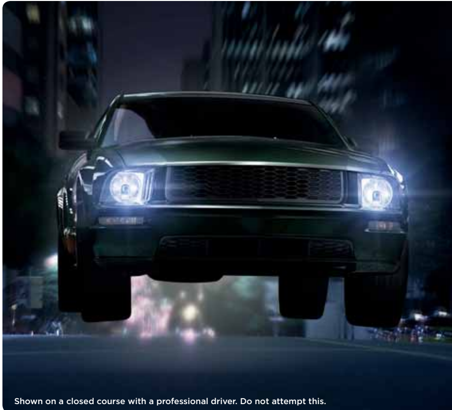
Shown on a closed course with a professional driver. Do not attempt this.