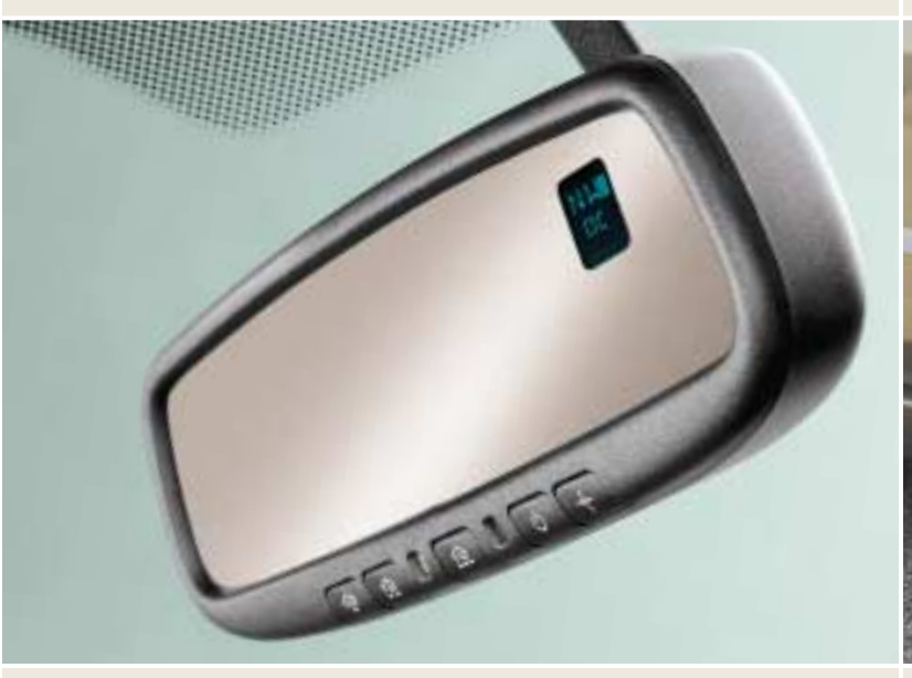
Electrochromic Mirrors and Electrochromic HomeLink® Mirrors. These top-selling mirrors eliminate headlight glare, plus much more! See page 6 for more details on their state-of-the-art features.