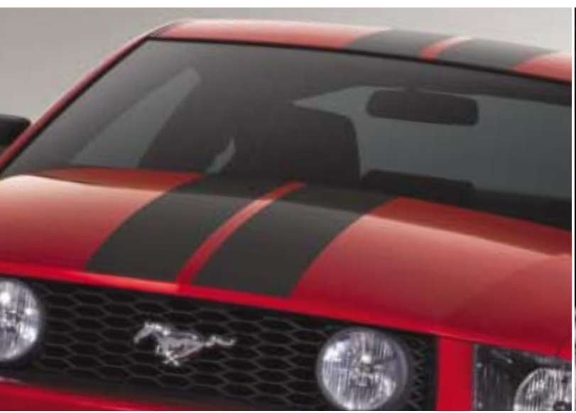
Racing Stripes. Add sporty style by personalizing your 'Stang with this best-selling kit. See page 5 for details.

Turn the page and discover a complete catalog of great choices to help you personalize your new Mustang. Engineered by Ford for a perfect fit and long-wearing durability, Genuine Ford Accessories click with the image of your American dream car: they're sportive, spirited and ultimately stylish. What's more, you can rely on precise professional installation at your Ford dealer and the backing of one of the industry's strongest limited warranties.