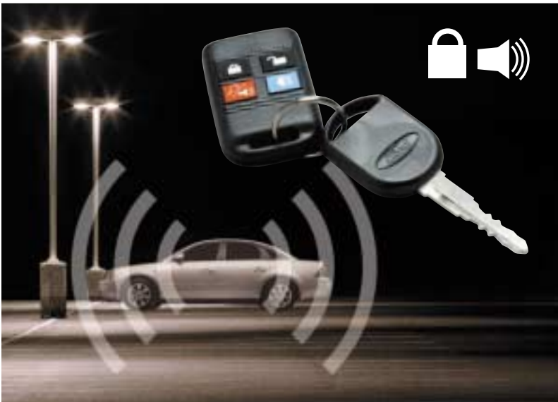
Vehicle Security System. On page 7, we offer products that are designed for your convenience and protection. This popular, state-of-the-art system protects your vehicle and its contents.