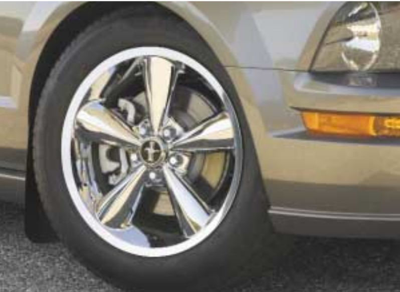
Custom Wheels. These new Mustang 18" wheels rock...and keep you rolling in style. You'll find a great selection of custom-designed wheels on page 6.